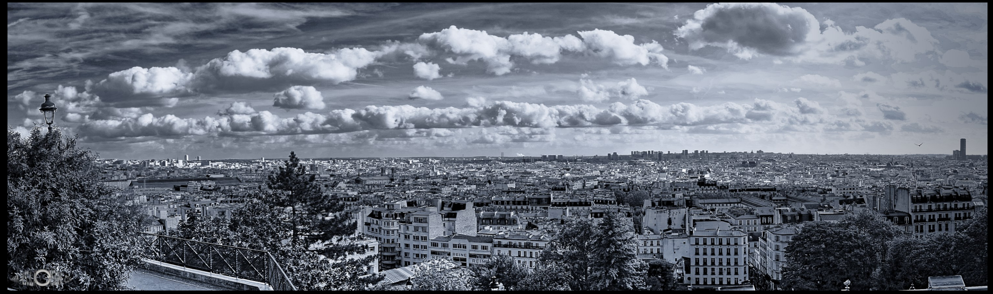
PANORAMIQUE PARIS BUTTE MONTMARTRE / Inédit