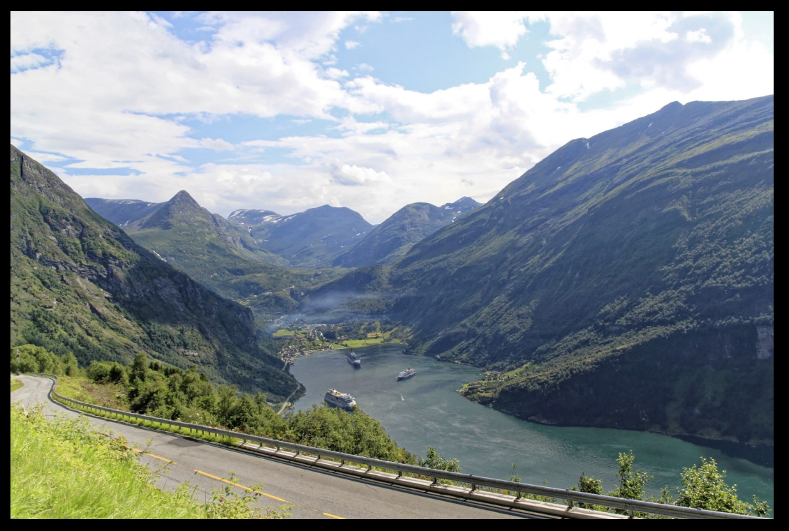
GEIRANGER FJORD - Norvège / Inédit

Since May 23, 2023, visitors to the site have been able to discover a new section, "L'instant passé du Jour" (<u>https://pascalmorsagne.com/en/galerie-26325-the-daily-</u>